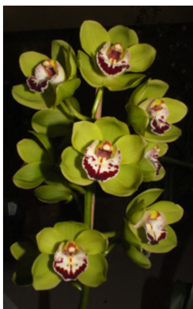
Cym. Gowling's Gem x Paradise Island (G Serhan)