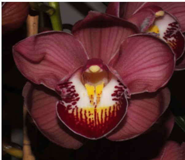
Cym. Dural Dream x Dural Pepper (G Serhan)