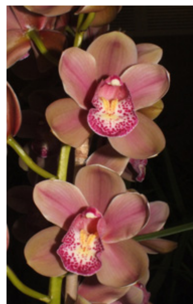
Cym. Winter Court x Cronulla (G Serhan)