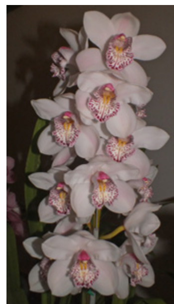
Cym. Kulnura Paradise 'Snow' (N Ciccari)