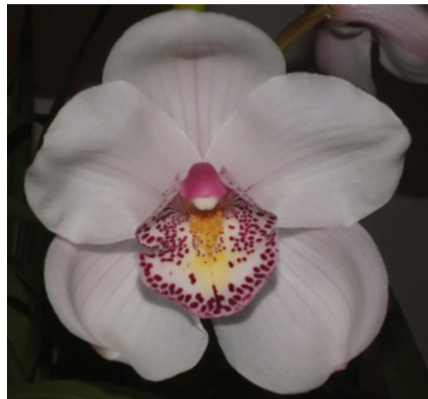
Cym. Lovely Angel 'Corker' (K&S Wynn)