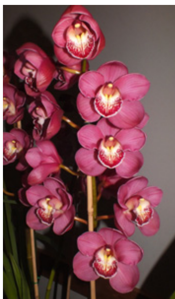
Cym. Lancashire Khan 'Evie' x Khan Flame 'Raquel' (D Mitsios)