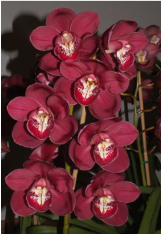
Cym. Regal Dream 'Dimitri' (D Mitsios)

Volume 40 No. 6 | August 2023 | Next meeting: 14 September (no meeting in August)