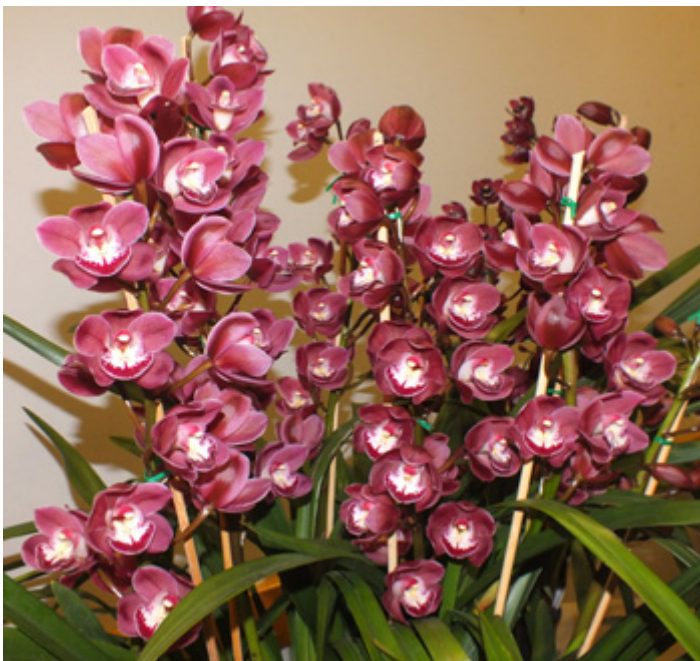
Cym. Jessie Blakiston x Lunar Blaze