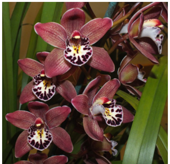
Cym. Lancashire Jim x Jimbo Rose