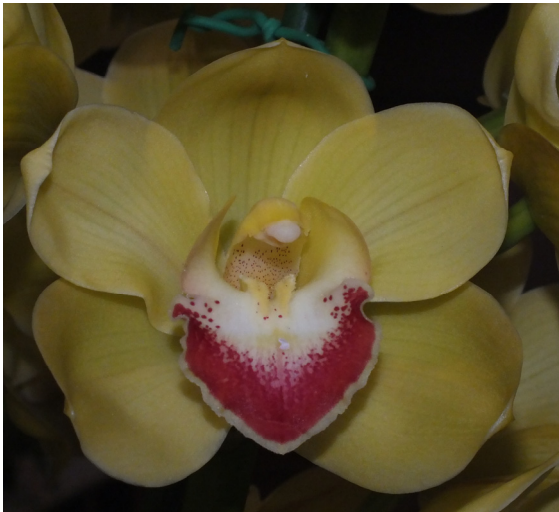
Top left: Cym. Zig Zag 'Kiwi' Above: Cym. Jacinta's pride 'Heaven' Left: Cym. Coraki Glowing 'Kentlyn'