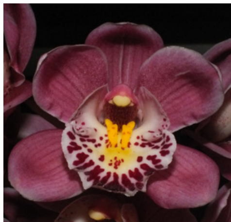
Cym. Jessie Blakiston x Lancashire Khan