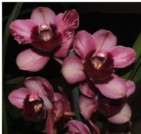
Cym. Khan Flame x Richard Tauber