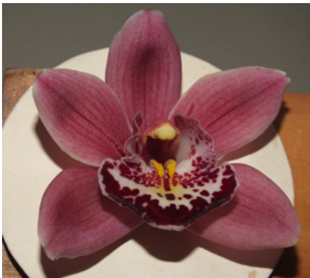
Cym. Jessie Blakiston x Lancashire Khan