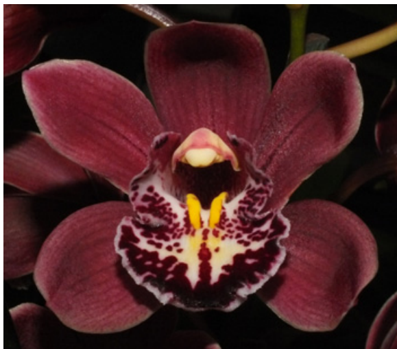
Cym. Jessie Blakiston x Lancashire Khan