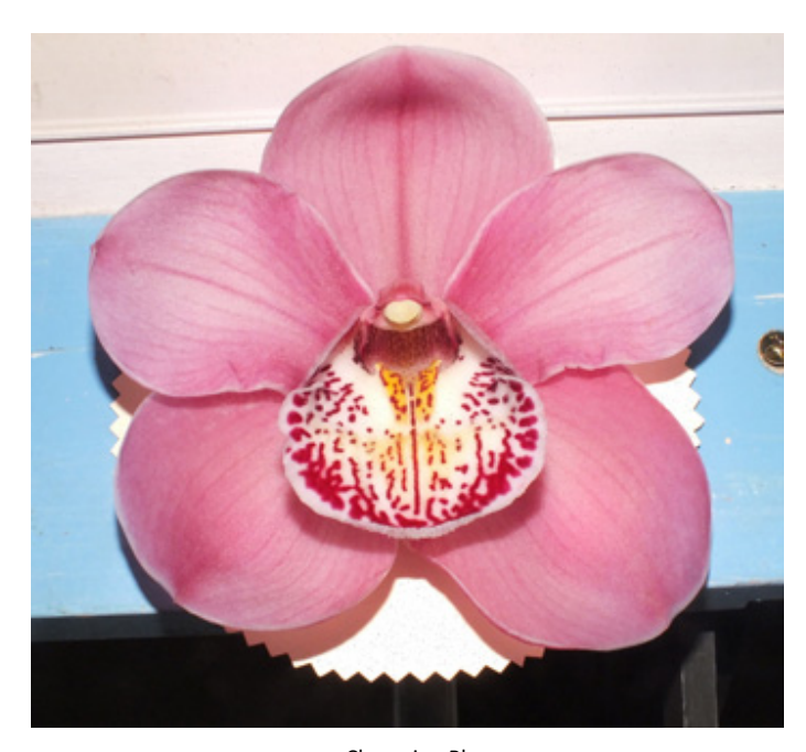
Champion Bloom Cym. Dural Dream 'Dural' (D Mitsios)