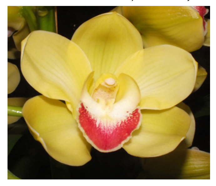
Reserve Champion Cym. Coraki Glowing 'Kentlyn' (B Janes)