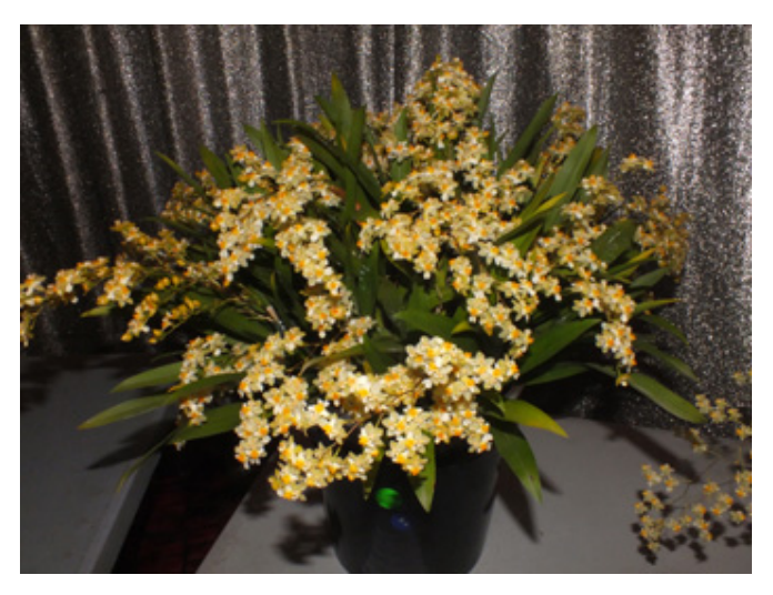
Champion Oncidinae Onc. Twinkle 'Fragrant Fantasy' (F Musial & L Chang)