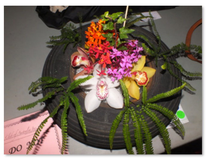
Champion Floral Display - Judith Brooks