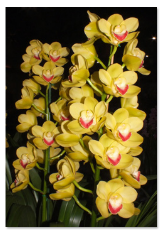
Reserve Champion Cym. Coraki Glowing 'Kentlyn' (B Janes)