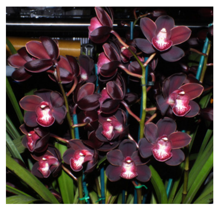
Champion Intermediate Cymbidium Cym. Red Khan X thunder 'Tempest' (G Serhan)